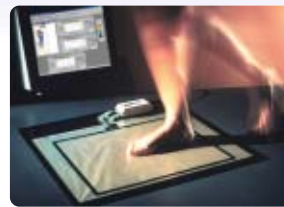
MatScan® System Platform Based Pressure/Force Measurement

Orthotic Energy offers the highest technology, foot pressure and force measurement in Canada.