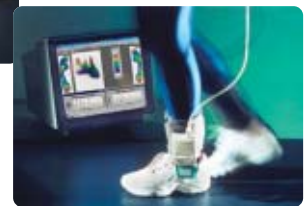
F-Scan® System Bipedal In-Shoe Plantar Pressure/Force Measurement